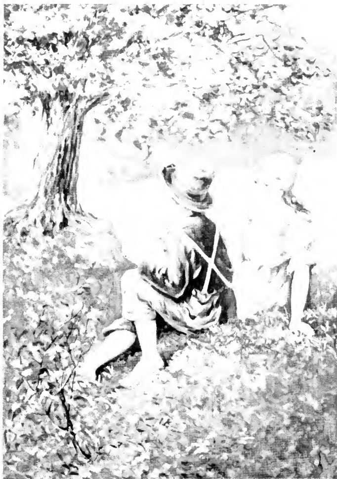
EMMA WATCHED EVERY STROKE WITH SILENT INTENTNESS